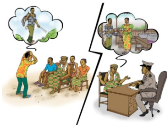
Figure 2. Example of advice on Ebola from a WHO/UNICEF/ONUICI picture book. 24

In addition to incorrect information, negative messages are also being disseminated. The USAID picture book encourages communities to report any newcomers to the authorities. The WHO, UNICEF and ONUCI picture book includes a series of images showing a man denouncing a hunter to the police, with the caption ‘I should report all preventive measure violations to the authorities’ ( figure 2 ). Even though both health workers and anthropologists have documented that stigmatization and coercion undermine efforts to control the disease, these books encourage a repressive management of the epidemic.